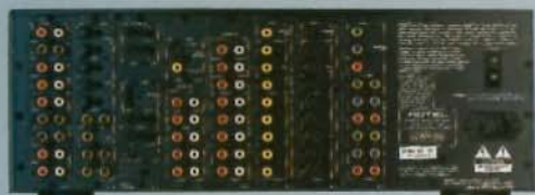
Rotel provides an RR-1050 remote control, equipped with programmable functions and an LCD